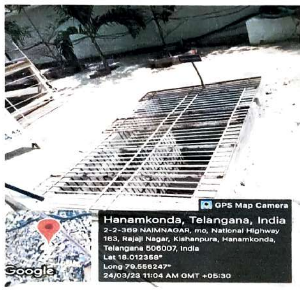
Water Harvesting Pit

Our college has rain water harvesting facility inside the campus. In open spaces with a high runoff coefficient and on the roofs of buildings, rainwater is collected. The collected rain water is directed in the harvesting pits located at possible place inside the campus to recharge the ground water. The rainwater harvesting pit is located in the premises of MBA-Block.