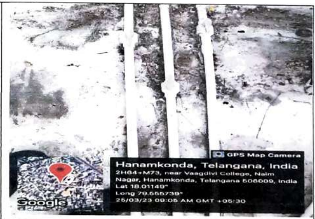
Water Distribution Systems in the College from the Tanks