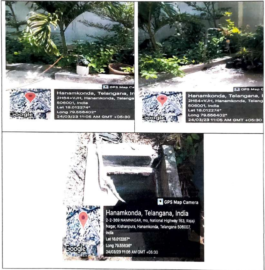
Bore well /Open well

problems. The bore well recharges are located within the college premises near the MBA Block.